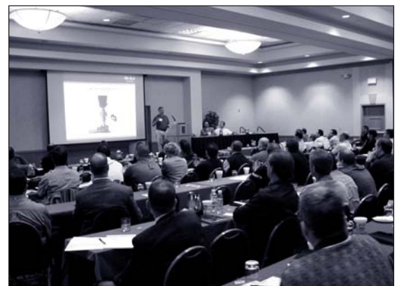
Full house for sessions.