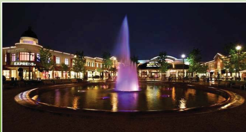
Easton Town Center Shops, Restaurants, and Clubs by Night

The Symphonie Aqua System makes it possible to recreate the loading forces on the residual limb exactly as they would be inside a prosthetic socket under actual full weight bearing conditions, producing an accurate and properly fitting plaster impression. The Symphonie Aqua System significantly reduces/eliminates the need for the cast modifications and the guesswork required when traditional, non-weight bearing casting methods are used.